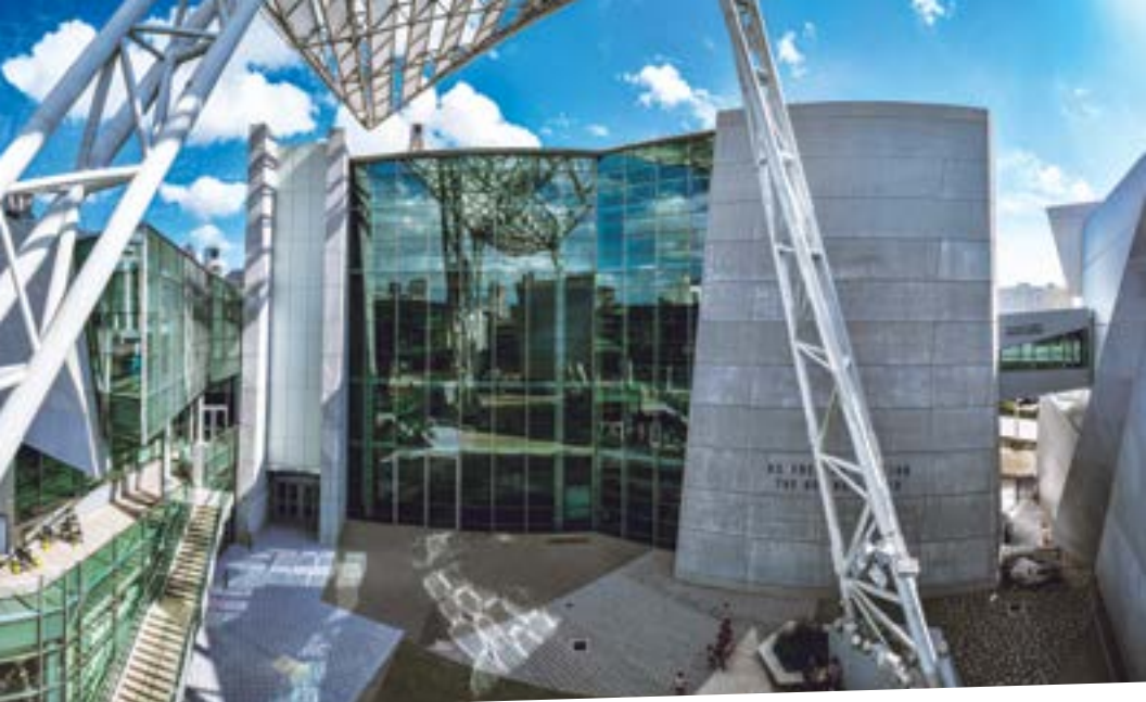
Col. Battle Barksdale Parade Ground