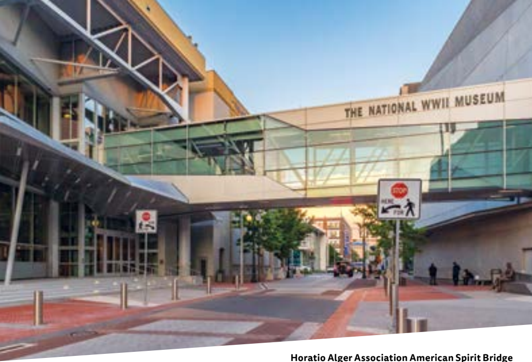
Horatio Alger Association American Spirit Bridge