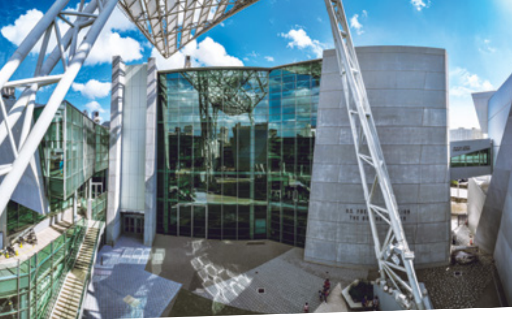
Col. Battle Barksdale Parade Ground