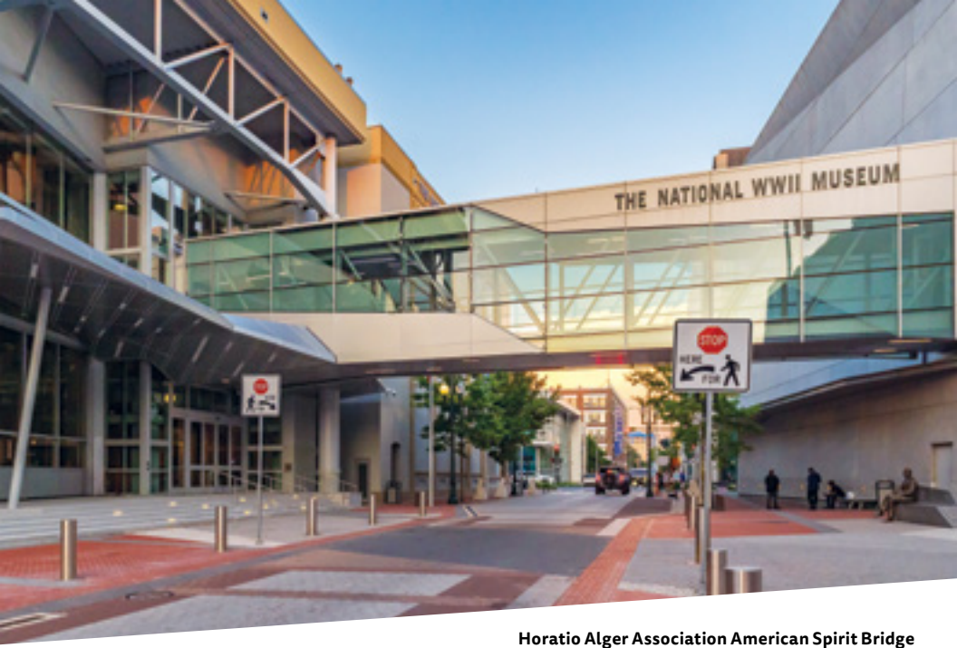
Horatio Alger Association American Spirit Bridge